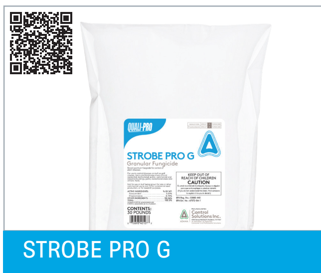
STROBE PRO G

A combination of two broad spectrum, preventative and curative fungicides with systemic properties for the control of many turfgrass diseases.