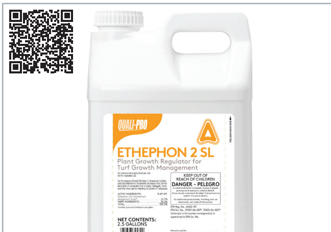
ETHEPHON 2 SL

Systemic, foliarly absorbed Type 2 PGR that promotes lateral growth in turf while limiting top growth and suppressing seedheads of Poa and white clover.