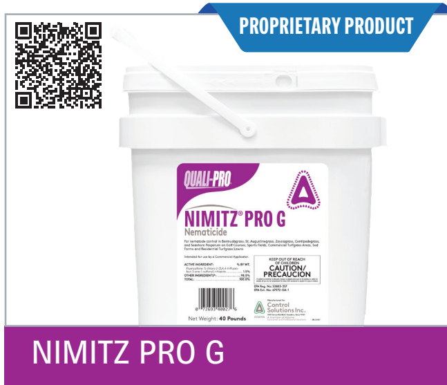
NIMITZ PRO G

Kills both ecto- and endo-parasitic nematodes on contact within 48 hours including: Lance, Sting, Lesion, and Root Knot