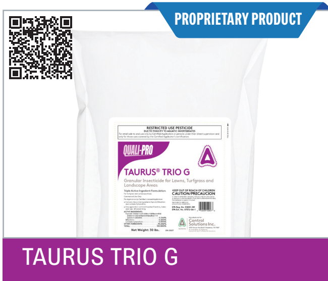
TAURUS TRIO G

Three-way granular insecticide delivers quick knock down of listed pests while providing long residual activity