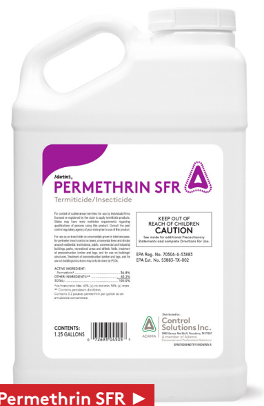
Permethrin SFR ▶

Use the higher rate for clean-outs and high insect infestations.