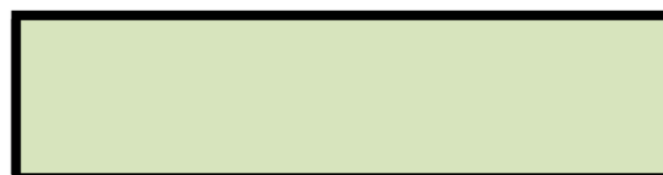
■ Bottom 1 -2 feet of the walls ■ House floor